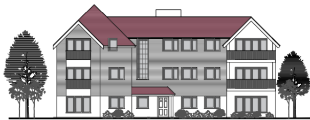
Proposed East Elevation Scale 1:100 Front Elevation